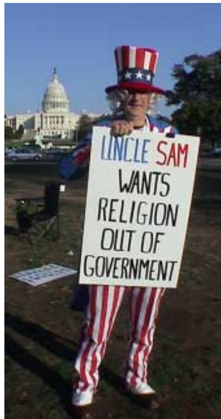
A marcher from Pennsylvania makes his point.

All in all, the rally was extremely well orchestrated and the speeches (audio of which is available at godlessamericans.org ) were very